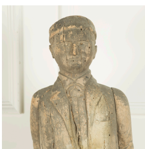
Babdown Airfield, Gloucestershire GL8 8YL T: 01666 503970/502199