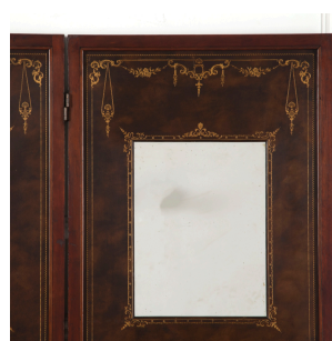
Babdown Airfield, Gloucestershire GL8 8YL T: 01666 503970/502199