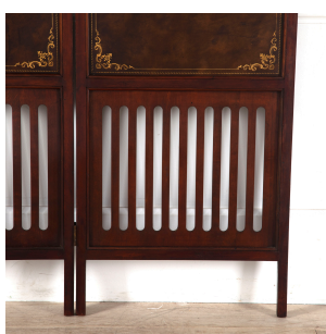
Gloucestershire GL8 8AQ T: 01666 505 111