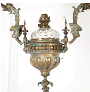
Gloucestershire GL8 8AQ T: 01666 505 111