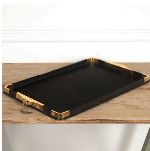
Gloucestershire GL8 8AQ T: 01666 505 111